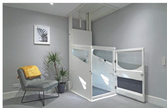
Harmony Wheelchair Homelift