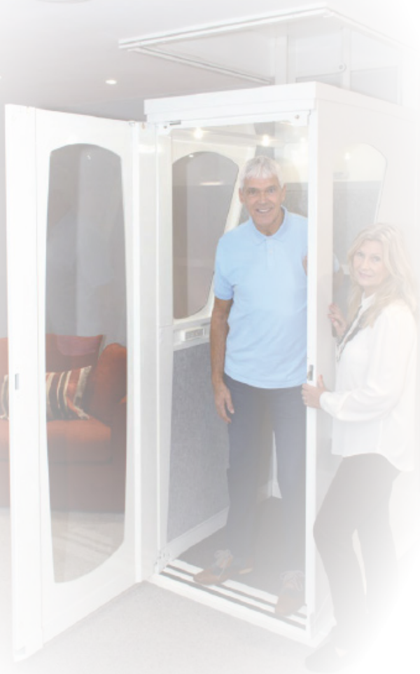
Harmony FE Homelift

For further information or to book your free no obligation consultation, call us today on 01892 557530 or visit www.innovatelifts.com to view our full range of homelifts